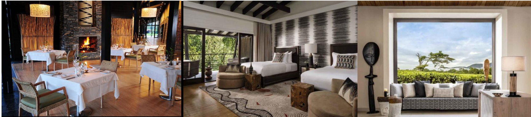
ONE & ONLY NYUNGWE HOUSE (All Inclusive- Lunch, Dinner, Bed and breakfast, a selection of drink & complementary brochured activities)